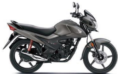
MATT CRUST METALLIC